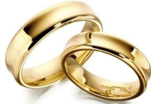
World Marriage Day

Its purpose is declared to be: "World Marriage Day honors husband and wife as the foundation of the family, the basic unit of society. It salutes the beauty of their faithfulness, sacrifice and joy in daily married life."