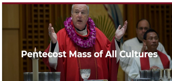
Pentecost Mass of All Cultures

Domingo 31 de mayo, disponible a las 6 AM disponible en el sitio de la Diocese of San Diego website: sdcatholic.org